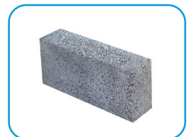
4 INCH (4" x 7" x 15" Solid Block)