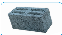
6 INCH (6" x 7" x 15" Hollow Block)