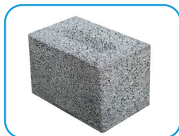
8 INCH (8" x 8" x 12" Solid Block)