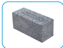
6 INCH (6" x 7" x 15" Solid Block)