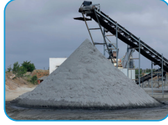
P SAND (Plastering Sand)