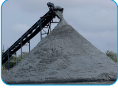
M SAND (Manufactured Sand)