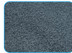
12 mm Metal (1/2" Jally)