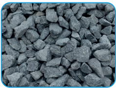
40 mm Metal (1 1/2" Jally)