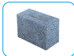
6 INCH (6" x 8" x 12" Solid Block)