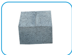
9 INCH (9" x 6" x 9" Solid Block)