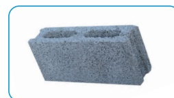
4 INCH (4" x 7" x 15" Hollow Block)