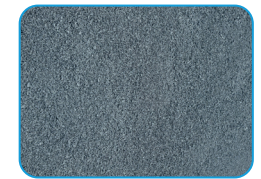
6 mm Metal (1/4" Jally)