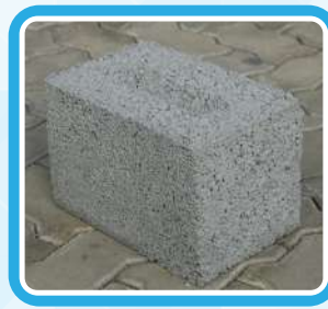
8" Solid Block