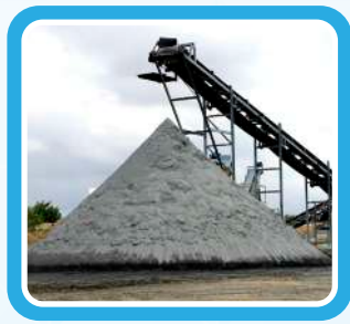
P Sand (Plastering Sand)