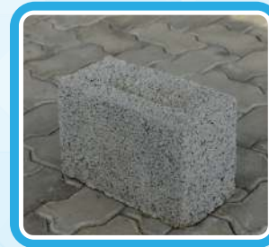
6" Solid Block