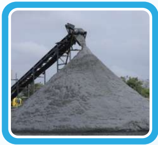
M Sand (Manufactured Sand)