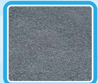
6 mm Metal ( 1/4" Jally )