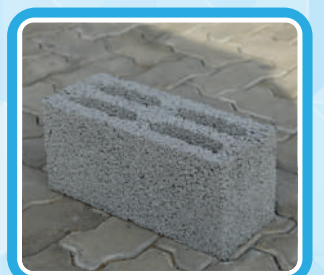
6" Hollow Block