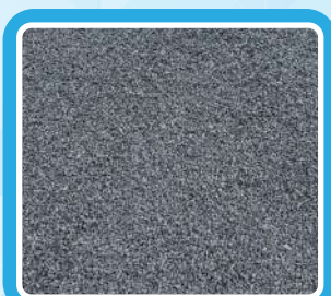
12 mm Metal ( 1/2" Jally )