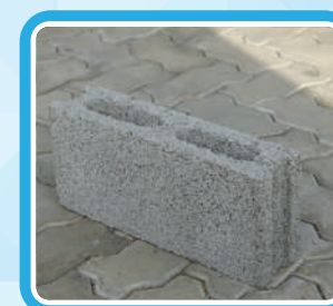
4" Hollow Block