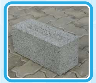
6" Solid Block