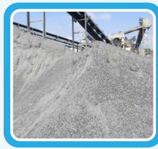
C Sand (Concrete Sand)