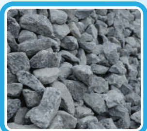
40 mm Metal ( 1 1/2" Jally )