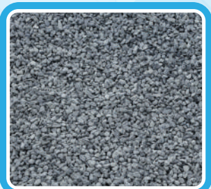
20 mm Metal ( 3/4" Jally )