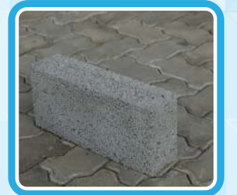
4" Solid Block