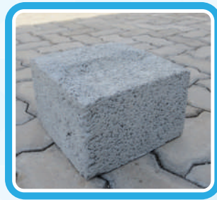
9" Solid Block